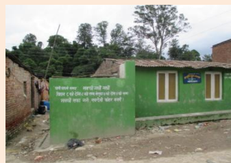
Balaju Community Building