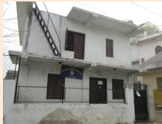
Classroom, Shree Tole