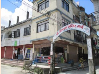
Shree Tole, Basundhara

The classes are located in the Surya Maya Tamang Community Centre in Shree Tole, Basundhara, a 10 minute walk from your host family. The community class room is directly opposite the Shree Tole arch shown in the first photo below.