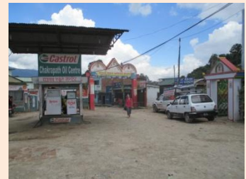
Chakrapath Petrol Pump