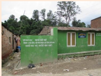
Community Building, Jagriti Tole

The classes are located in a small community room in Jagriti Tole, Balaju, a 15 minute bus/micro ride from Basundara, around the ring road to the west. The community class room is a 2 minute walk from Balaju Chowk (where you will get off the bus) just behind the Chakrapath Oil Centre Petrol Pump. Walk under the arch on the far side of the petrol pump and the green community building is just down on the right hand side. The entrance to the room is at the back of the building.