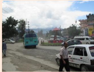
Balaju Chowk (roundabout)