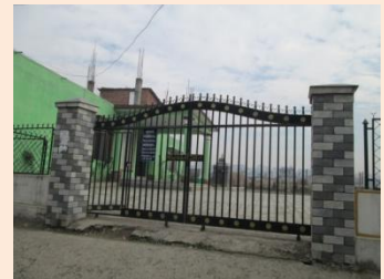
Enter through these gates and cross basketball court to reach classroom