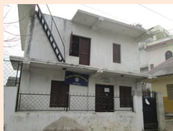
Basundhara Community Building