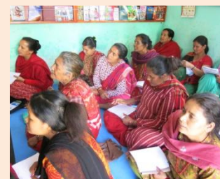
Basundhara Literacy Class