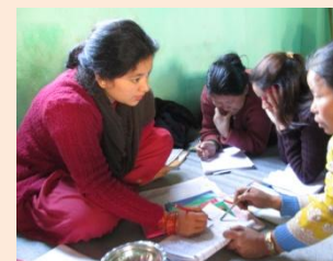
Balaju Literacy Class