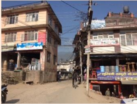
Road leading off ring road