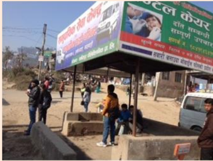
Thulo Bharyang stop

The school is located in Thulo Bharyang, a 30-40 minute bus ride from your host family. The school can be found down a side street reached from a turning off the ring road, shown in the photos below.