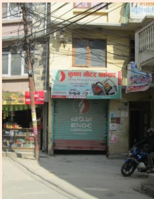
Turn right at this T junction