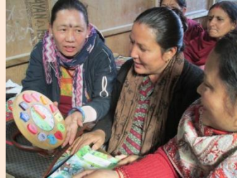
Learning to tell the time