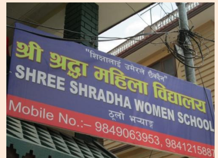
Sign outside school