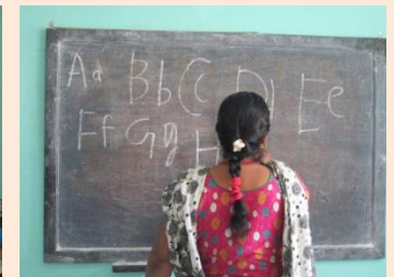
Class 1 student