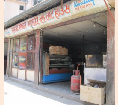
A good place for lunch